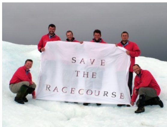
The campaign went as far as the North Pole